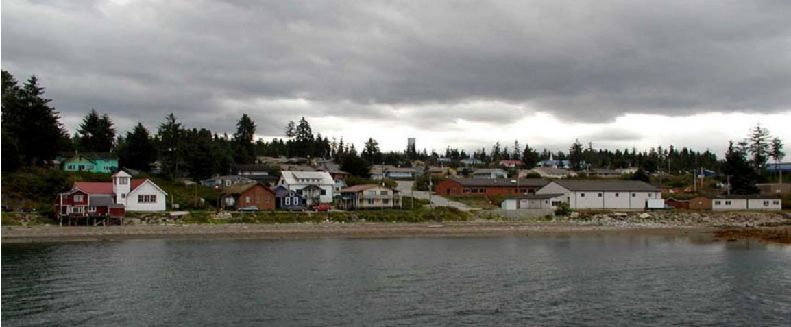
Photo 1: Angoon waterfront; photo© courtesy of Nicole Grewe, DCRA, 2006.