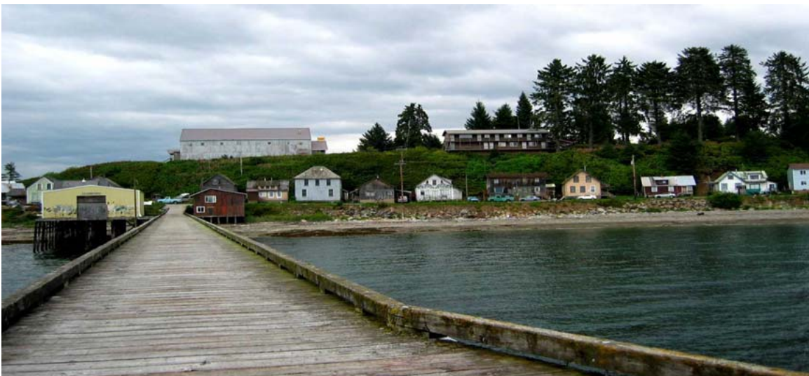
Photo 3: Angoon city dock; photo© courtesy of Nicole Grewe, DCRA, 2006.