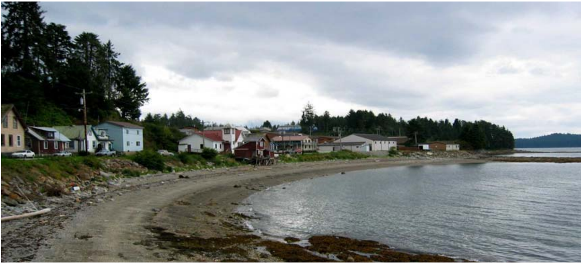
Photo 2: Angoon waterfront; photo© courtesy of Nicole Grewe, DCRA, 2006.